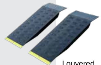
Lowered approach ramps

Challenger's 14,000 lb. closed-front drive-on 4-post lift features a low approach angle and wide runways for easy approach. It also has one of the highest rise in the industry and durable column construction. We designed the 4P14 for versatility, with lowered approach ramps as well as in two lengths. A range of optional accessories can help you accommodate just about anything that comes in for service.