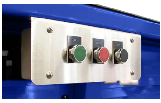
Bench Mount Controls

Controls are also available in a lever option for no additional charge.